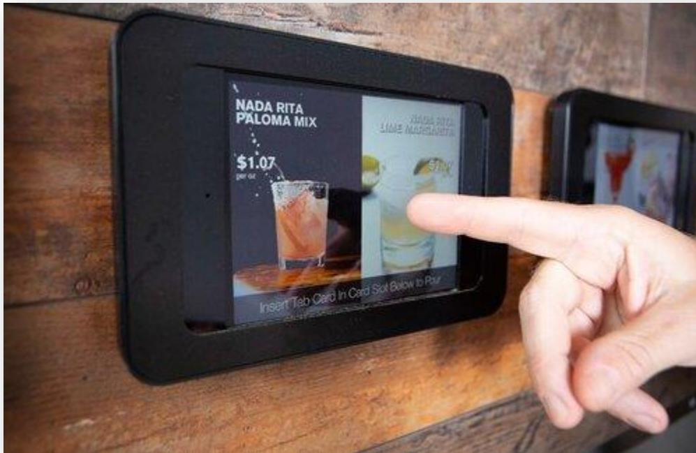
Table Tap can also enable a second layer of security to ensure underage residents are unable to access that taps through our optional 4 digit pin code, making it a great option for multi-family developments. Our self-pour technology fosters socialization between tenants and helps to build a sense of culture and community throughout your property. The sweet spot for residential developments is 2-12 taps. Differentiate your Urban Living space with a Table Tap turnkey solution.

People dream of living in a space with draft beverages on tap, yet many apartment communities have struggled to offer draft beverages on tap due to the cost of goods sold and liability. Table Tap is your solution. Table Tap's self-pour monitoring and control technology allows property management to limit daily consumption per resident. Tenants will receive a RFID card, which gives them access to a predetermined amount of ounces per day. Through integrations with Xero and GoCardless, we are able to bill daily, weekly or monthly for consumption. Whether you are looking to offer the draft beverages for free or charge your residents, our software gives you the power to be in control.