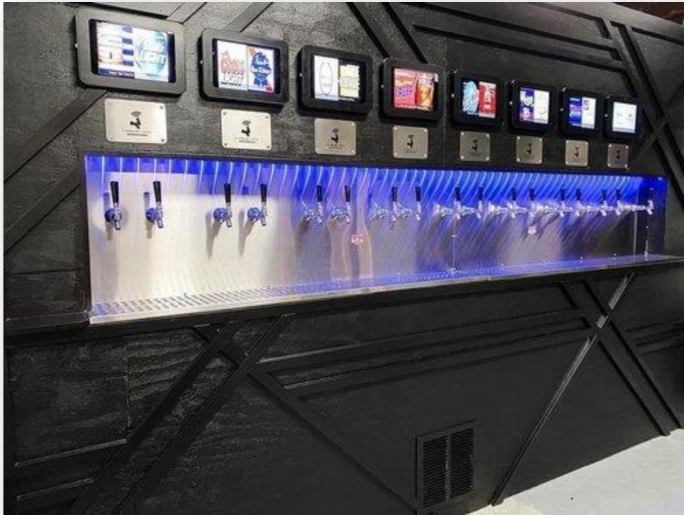
Table Tap's fully integrated solution is a perfect fit for restaurants, bars and taprooms of all shapes and sizes. Whether you are a full capacity table service operation or a microbrewery catering beverages to everyone who walks in your doors, our system can help streamline your operations and increase your revenue. The sweet spot for a taproom is 24-80 wall taps, depending on square footage and concept.

Currently, there is an amenity war for attracting new tenants to urban living communities across the country. Developers are looking for a differentiating factor to draw in residents and found self-pour technology to be the answer.